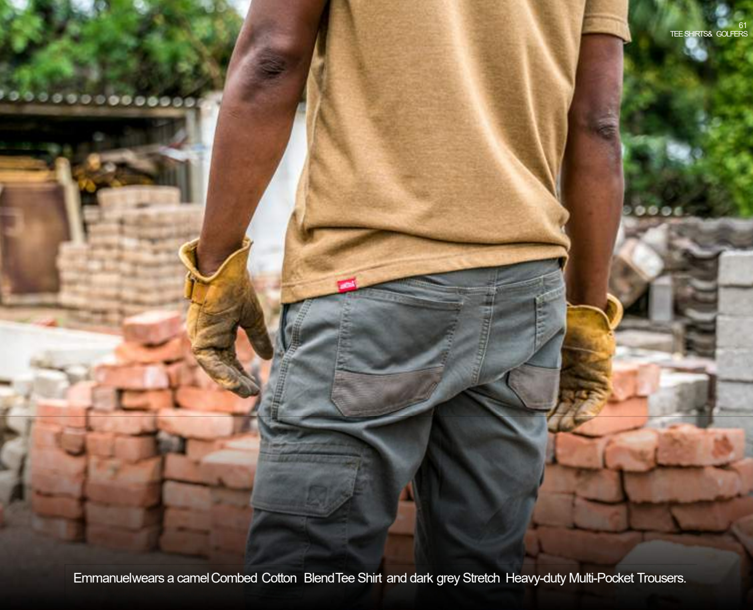
Emmanuel wears a camel Combed Cotton Blend Tee Shirt and dark grey Stretch Heavy-duty Multi-Pocket Trousers.