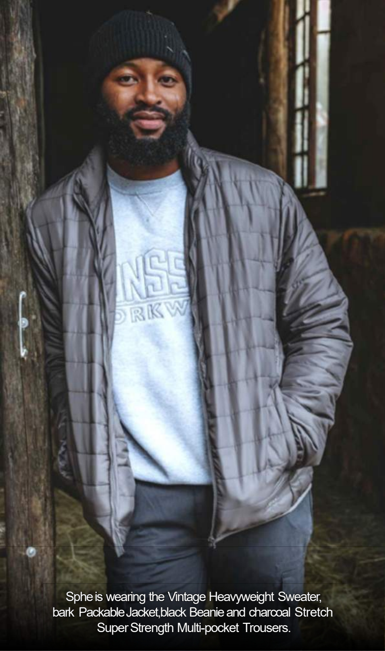
Sphe is wearing the Vintage Heavyweight Sweater, bark Packable Jacket,black Beanie and charcoal Stretch Super Strength Multi-pocket Trousers.