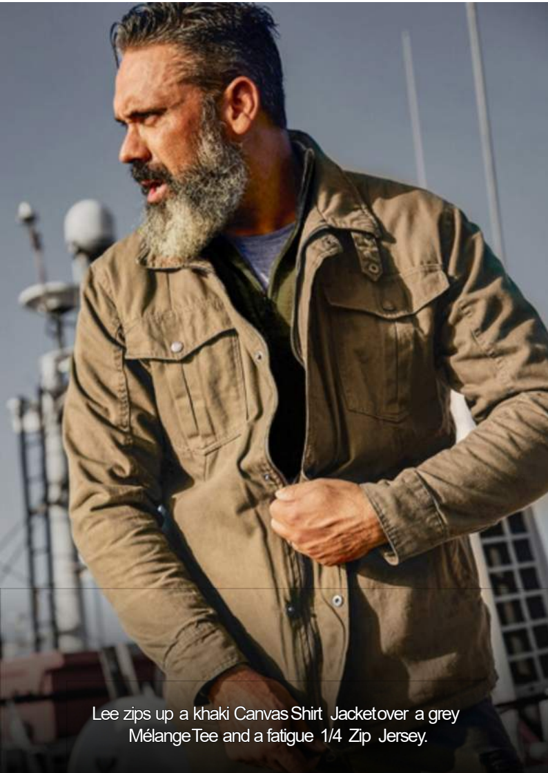
Lee zips up a khaki Canvas Shirt Jacketover a grey Mélange Tee and a fatigue 1/4 Zip Jersey.

FABRIC: 100%Polyester Polar Fleece WEIGHT: 270gm 2 SIZES: S M L XL 2XL 3XL 4XL COLOURS: Navy,Charcoal,Black,Fern FEATURES: Feminineathletic fit / Front sideentry pocketswith zip for securestorage/Two generous inner mesh fabric pockets / Lip elastic on hem,neck and armhole for secure fit