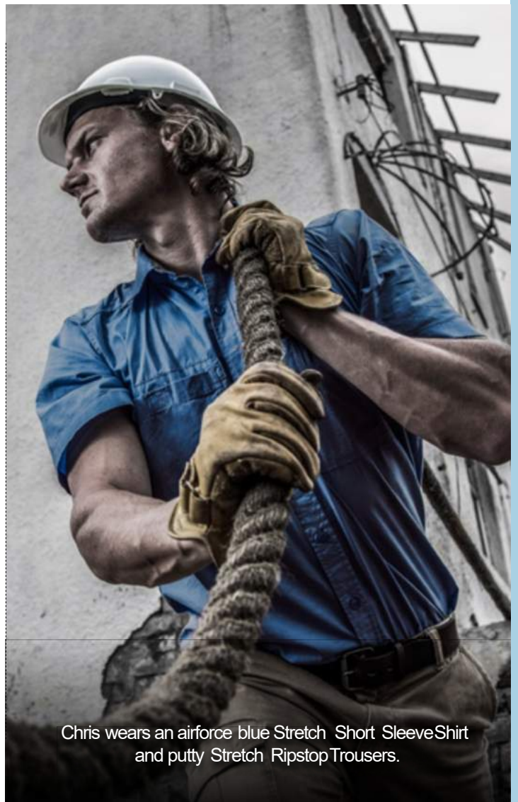
Chris wears an airforce blue Stretch Short Sleeve Shirt and putty Stretch Ripstop Trousers.

FABRIC: 97% Cotton, 3% Spandex WEIGHT: 120gm 2 SIZES: S M L XL 2XL 3XL 4XL 5XL COLOURS: Pebble, Airforce Blue, Fern, Navy FEATURES: Double needle lapped seams for extra strength / Shaped hem / Hook-and-loop closure on right chest pocket with self-fabric behind for reinforcement / Pen division on left chest pocket / Jonsson engraved buttons